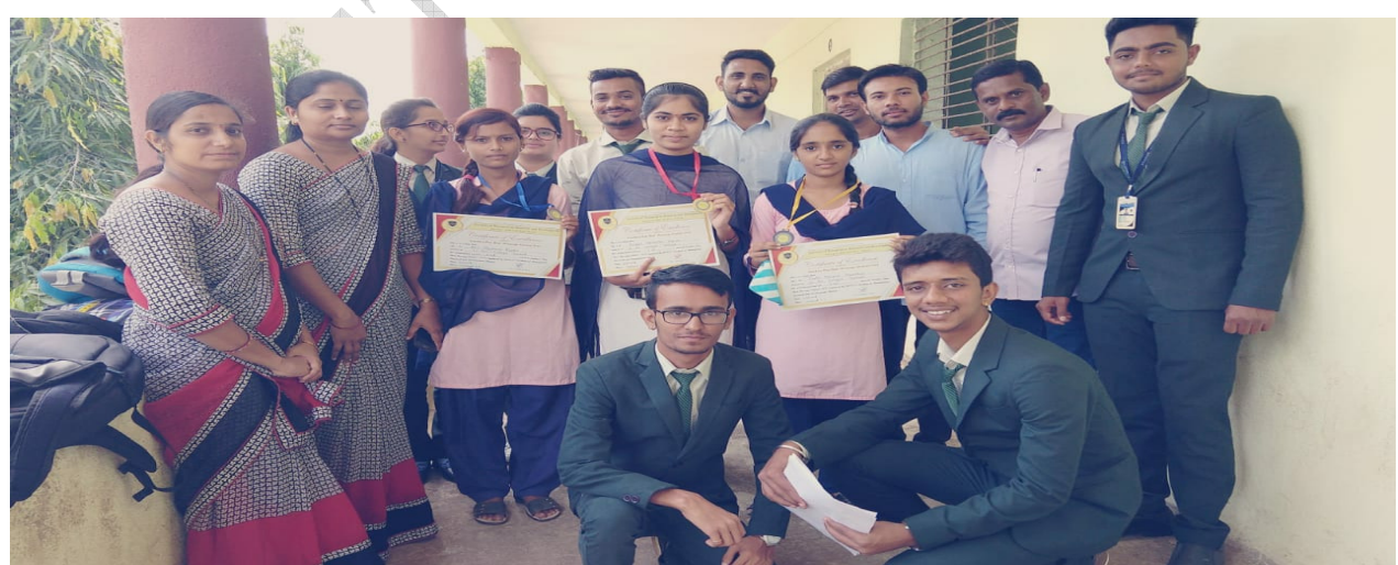
Institute students with winners of best message contest