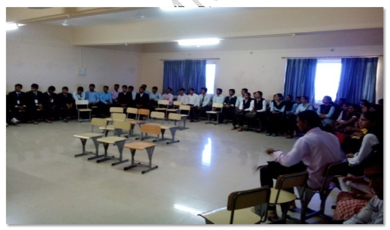
Student and staff participating in workshop