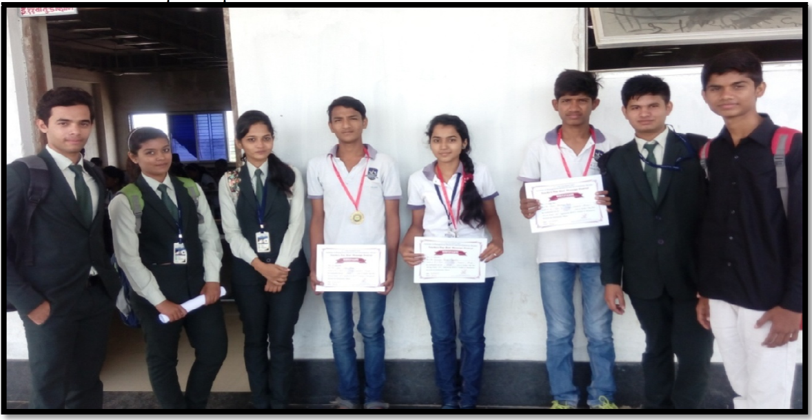
Institute students with contest winners