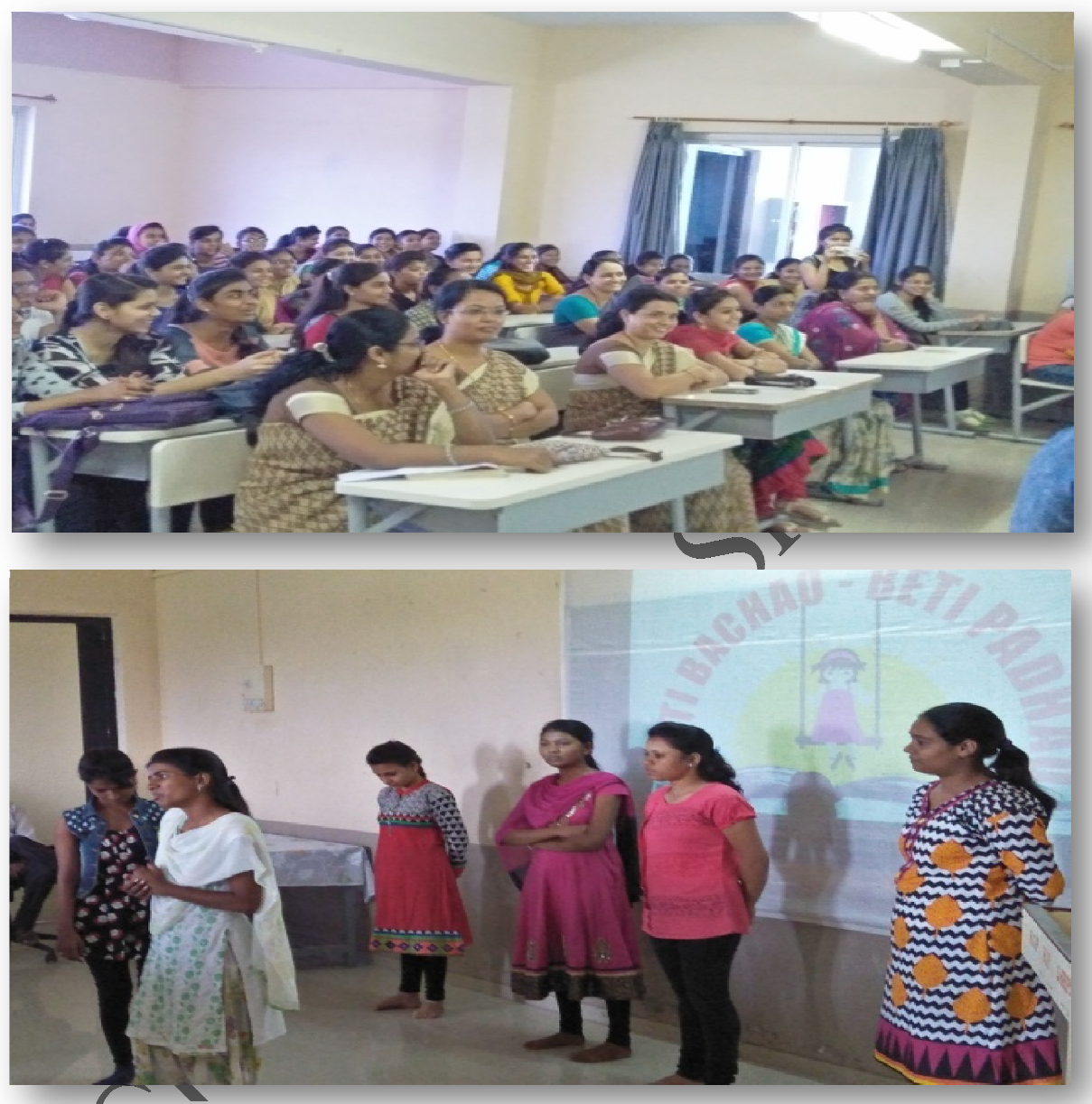
Institute Students presenting drama on Beti Bachao Beti Padhao.