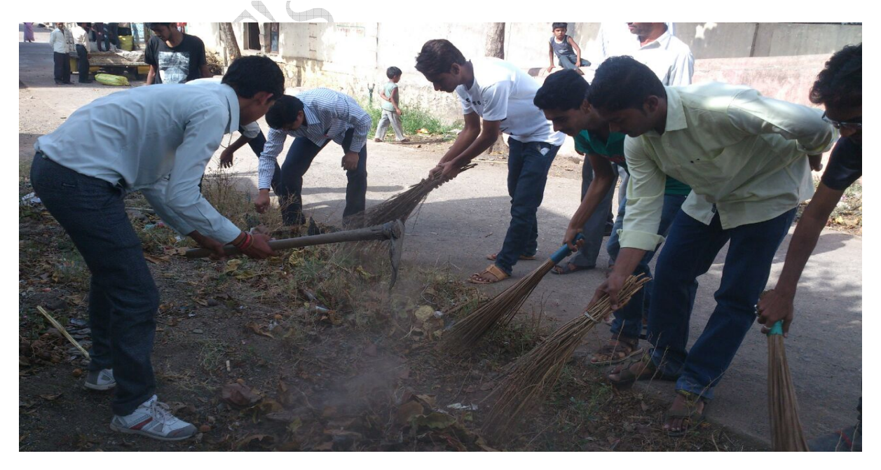
Institute faculty members and student cleaning kalamsare village