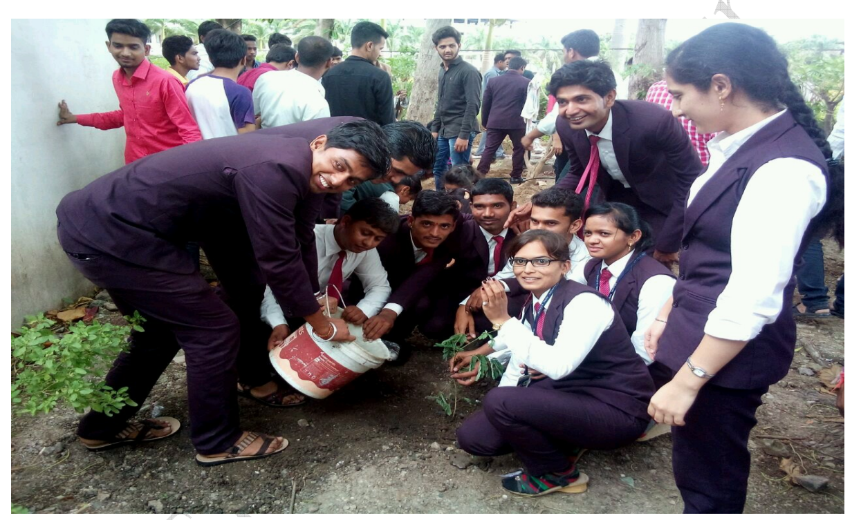
Institute students planting trees in rural area.

Under this activity 30 students are participated.main objective is to improving environmental conditions and providing multi-disciplinary learning for students of all ages. It teaches them about plants and shows them how their efforts make an impact that they and their communities can revisit for years.