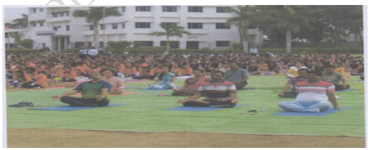
Institute Student in yoga session

Institute faculty members in Yoga Session