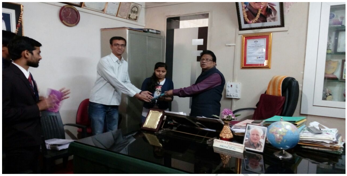
Awarding winner students with faculty member.