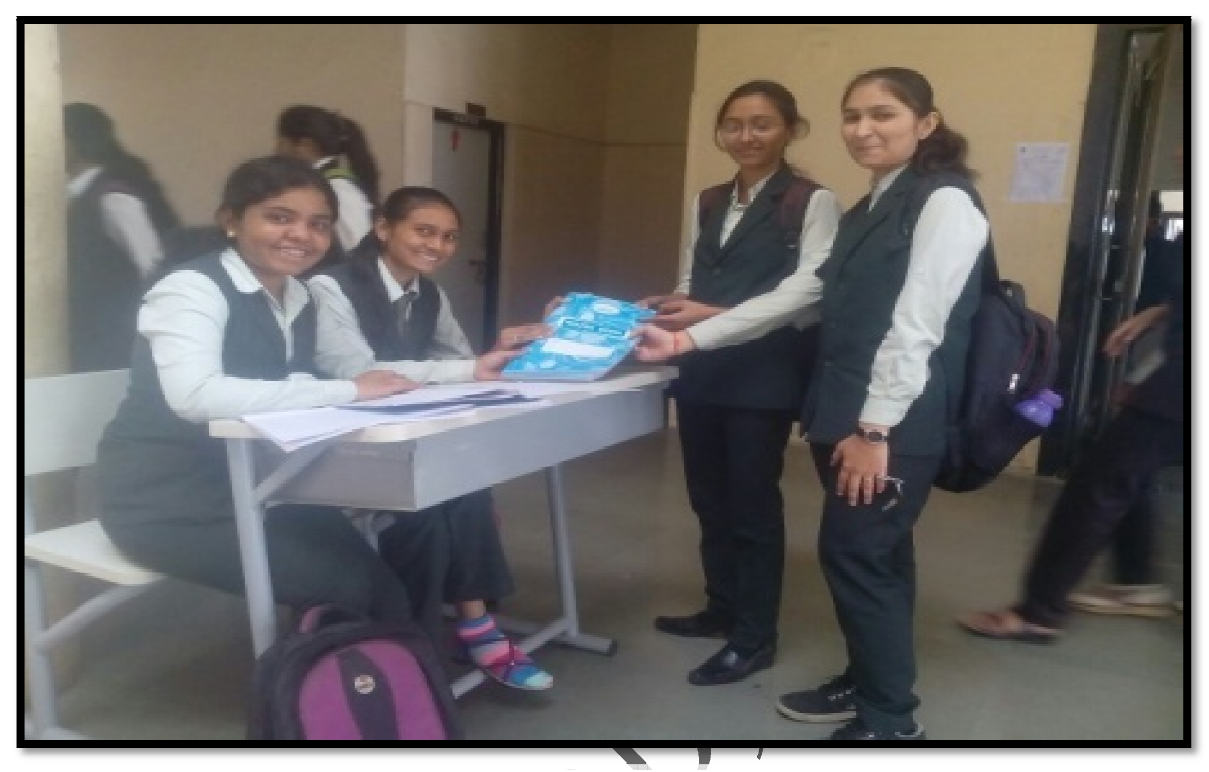
Institute Students donating study material and clothes.