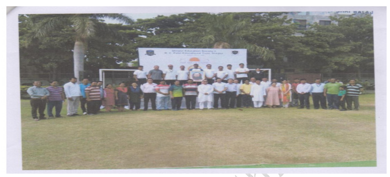
Institute faculty members at national yoga day