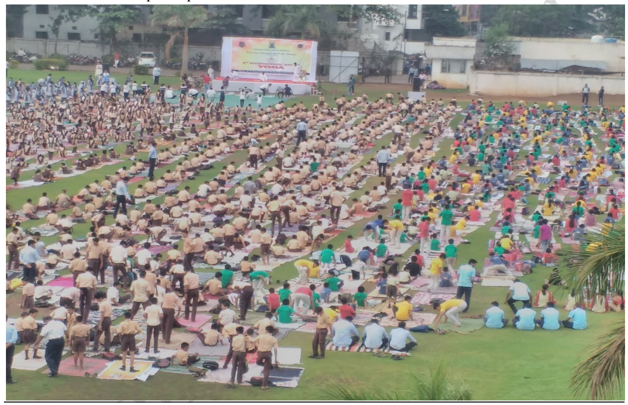
Institute faculty members and students participating in yoga day