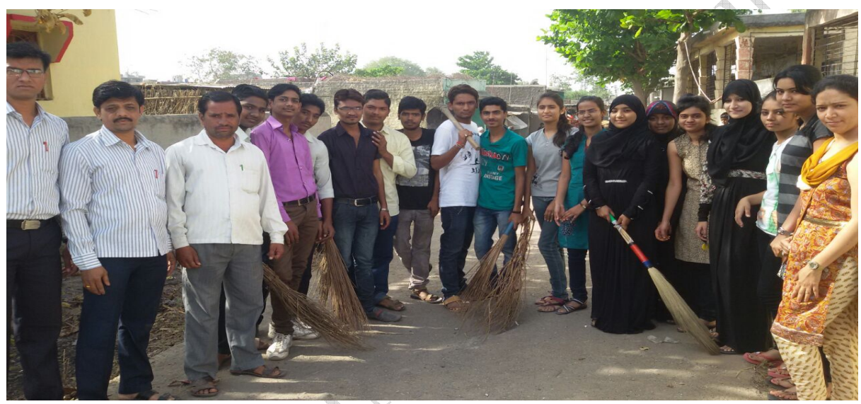
Institute faculty member and student in swachh bharat abhiyan at kalamsare

The main purpose of this program was to create awareness among the students regarding Cleanliness and its benefits. Under this program, 15 students participate. Even faculty member were the essential part of this drive. As a part of this Cleanliness Drive, we had to clean the whole village. This activity is conducted in kalamsare village near Shirpur.15 students are participated in this activity.